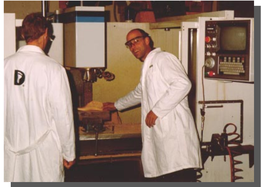
State-of-the-Art Machining According to the Data of the 3D Computer Last Model