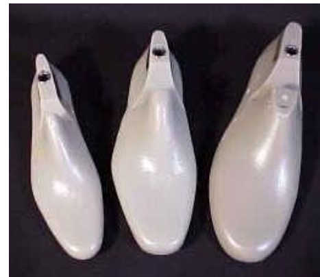
Narrow - Wide - Large Examples of Individualized Shoe Lasts